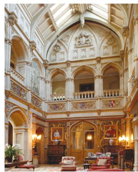
The Saloon, with 50' vaulted ceiling, lies at the heart of Highclere Castle

The Castle Tearooms serve lunches, teas, coffees and a range of sandwiches and cakes, freshly made every day in the Castle's kitchens, whilst the Gift Shop is open from 12 noon to 5pm selling local produce, small gifts, Egyptian mementoes, jewellery and books