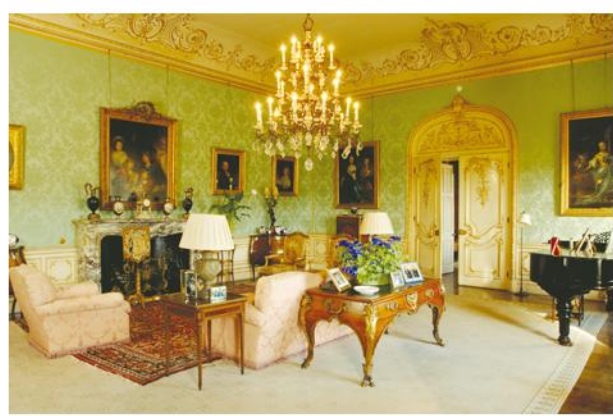
This lovely south facing Drawing Room was very much the work of Almira, the 5th Countess of Carnarvon, in the late 1890's