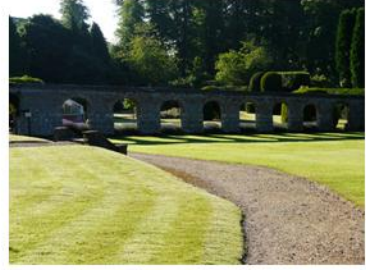
The Gardens and Grounds are included in the Tour Ticket

Visitors can enjoy walks through the Castle's lawns, the 'Monks Garden', 'the Secret Garden' and the Woodland Walks